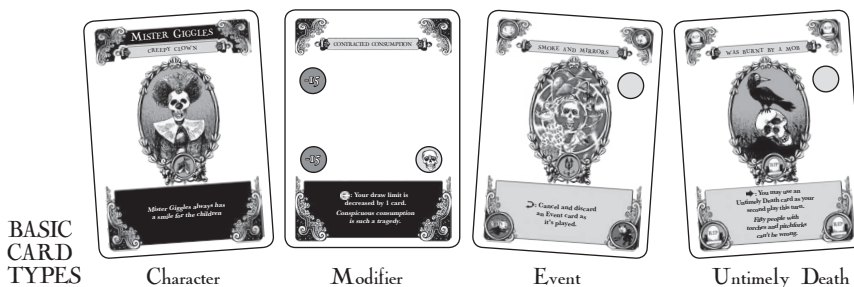
BASIC CARD TYPES

Self-Worth Points: These are the numbers on the left side of the card, and there are 3 spaces for them. Combine all of the visible points on a Character to determine its Self-Worth score. Add the scores of your dead Characters together to get your total Family Value. Remember: living Characters never contribute to your Family Value.