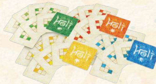
32 Personal Color Cards (8 Cards x 4 Colors)