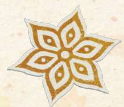
First Player Marker