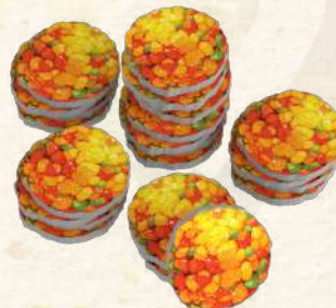
24 Sweets Tokens