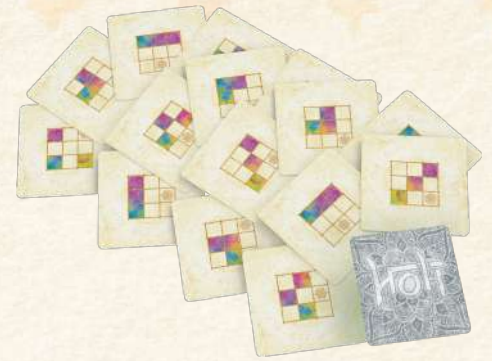
18 Global Color Cards