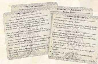
4 Helper Cards