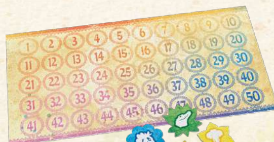
Score Track & 4 Score Markers