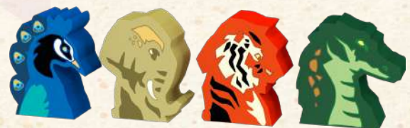
4 Resin Player Markers