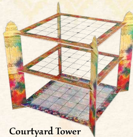
Courtyard Tower (4 Pillars, 1 Top Board, 2 Middle/Bottom Boards)