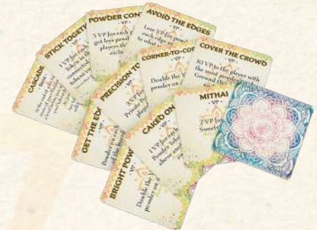
12 Rules Cards