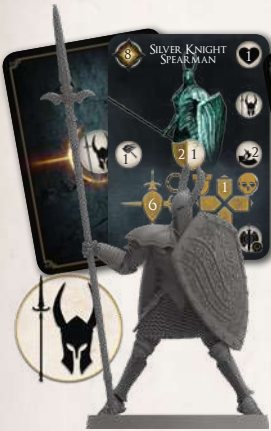
Silver Knight Spearman