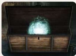
Ambush card Treasure face