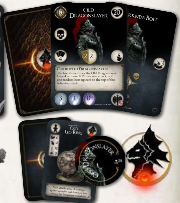
Old Dragonslayer Dial and Cards