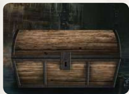
Ambush card back

When the party opens a chest (see 'Chests' on p. 17 of the Dark Souls™: The Board Game rulebook), flip over the Ambush card beside the tile containing that chest. If the card shows 'Treasure', resolve the chest normally. If it shows 'Mimic', a battle with a mimic ensues instead.