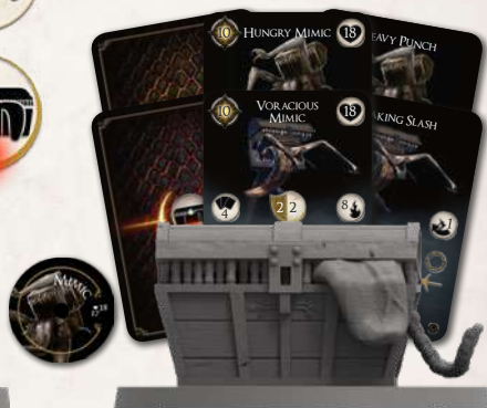
Closed Mimic (after the party is defeated by a Mimic)