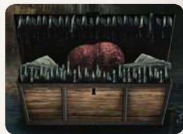
Ambush card Mimic face

Example of a game setup with facedown Ambush cards by each tile.