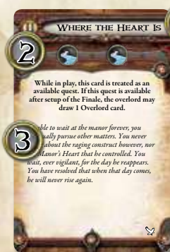
ADVANCED QUEST CARD FRONT