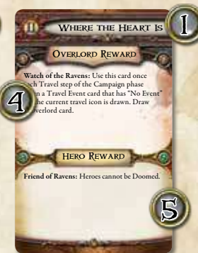
ADVANCED QUEST CARD BACK