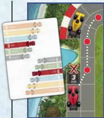
Red can't use the ramp because Yellow is blocking the landing space.

The ramps are NOT a space and a car may not end its turn on a ramp. When a car uses a ramp, move it directly to the ramp's landing space. This counts as 1 space of movement. If the car has additional movement remaining, it continues moving as normal. Cars may use multiple ramps in one turn.