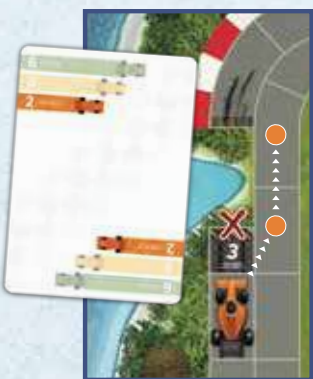
Orange can't use the ramp because it doesn't have enough speed.