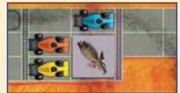
Yellow's movement is blocked by the elephant. Orange's movement is blocked by the elephant and the blue car.

Each animal occupies one space on the board, which are larger than regular spaces. Animals block movement into the spaces they occupy, just like a car.