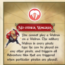
Adventures in play

Each player receives 8 cards. They make up his Hand.