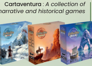
Cartaventura : A collection of narrative and historical games