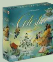
Celestia : THE must-have push-your-luck game