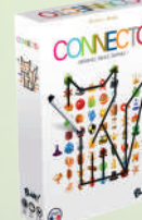
Connecto : Dot-to-dot drawing reinvented for the entire family