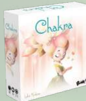
Chakra : A Zen vibe, a time to reflect in search of inner peace