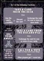
4 Reference Cards