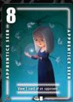
4 Apprentice Seers