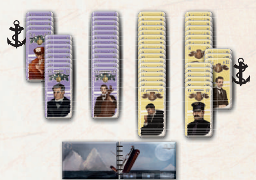
The team scores 70 points.