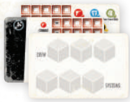
3 Player Tracking Cards