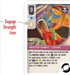
Engage Strength Icon