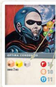
Captains: Number/type of dice to be taken during setup