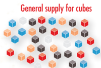
General supply for cubes