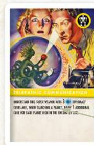
Super Weapons: Action text regarding Understanding this weapon