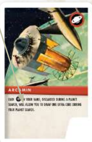
Planets: Action text which may supersede rules in the rulebook