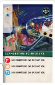
Locations: The active Action is matched to the icon on the Cosmic Hegemony Alien's card for the current Encounter deck