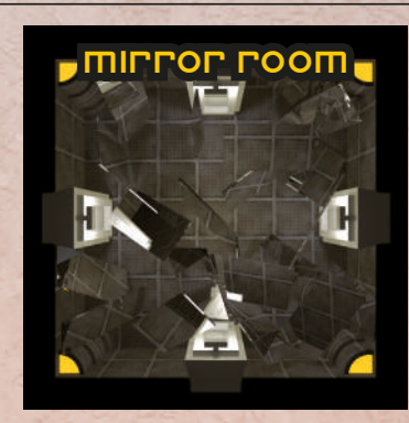
"Look at yourself in the mirror! You don't look so good... "

Note on the M.A.C. red cards: Do not mix them with the other M.A.C. cards unless you are using the "Madness" Cooperation variant or Solo modes or unless all players agree to do so before the game is started.