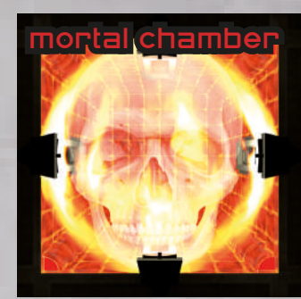
"My favorite one! No season 2 for you!"

After your second action of the next turn, if your character is still there, you drown.