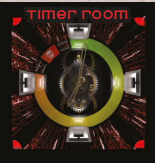
"Sorry, we'll be off the air soon. Hurry up!"

Immediately exchange the Illusion room with any hidden room on the board. Reveal the new room, place your character in it and apply its effects. Therefore, the Illusion room takes the empty space of the board and will stay revealed for the rest of the game. If all the rooms are already revealed, this room has no effect.