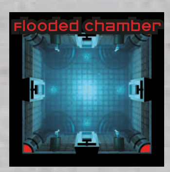
"Hold your breath, water is coming! I would leave if I were you!"

You have to leave this room with your next action or you're executed.