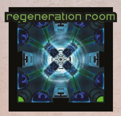
"What a pleasure to see you in one piece!"

with the ultimate rules you will play more complex and more dan gerous.