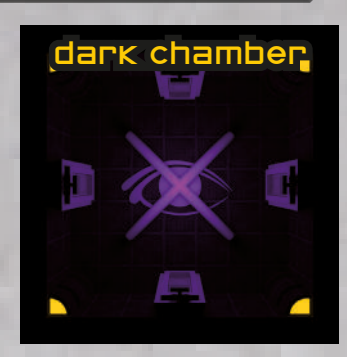
"Wonderful, a dark chamber! Perfect for developing your sense of touch... if you have time!"

In this room you can only program one action during the Programming phase. A revealed guard starting his turn in this room will only execute one action.