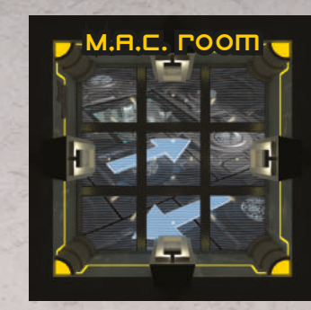
"I don't know what it is, but I hear a noise and then the complex moves again."

Immediately draw a card from the M.A.C. deck and apply its effects.