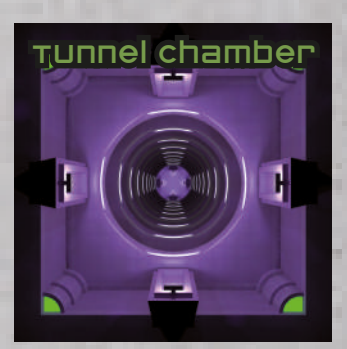
"Fabulous, a molecular transporter... but will it work?"

Look secretly at any room of the board then place it back where it was.