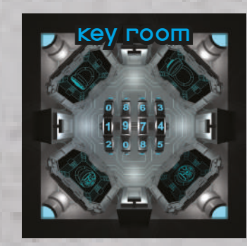
"Congratulations! You've solved half the puzzle!"

Exit room. When all the prisoners have entered this room, one of them has to move it out of the Complex using the Control action.