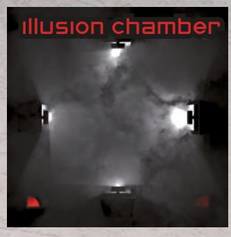
"Great! The room of your dreams, or at least. that's what it claims to be..."

If you have lost some of your tokens because of a Punishment M.A.C. card, do not mix them into your pile.