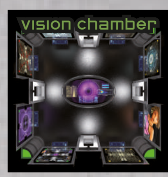
"Video screens, excellent! A good time to place your token!"

Slide any line of the board (except the central ones) in the direction of your choice. Slide all the rooms one rank following the same process as for the Control action (see Actions - Control).