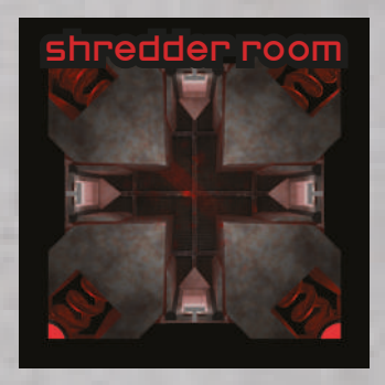
"Wait for me! I thought I just saw the wall move!" "BLAM!"

When you enter this room, you are instantly eliminated.