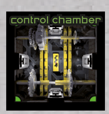
"Terrific! Mechanisms and controllers! You look handsome with your hands all dirty!"

When entering, take this room and exchange it (and your figurine) with any hidden room on the board. The hidden room stays hidden. If all the rooms are already revealed, this room has no effect.