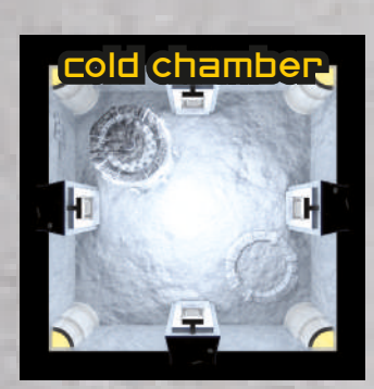
"What do I prefer in the cold chamber? The temperature!"

You can only leave this room by moving onto a character located on a room adjacent to yours OR by moving onto the Central room, if it's adjacent to the Prison room when you want to leave it.