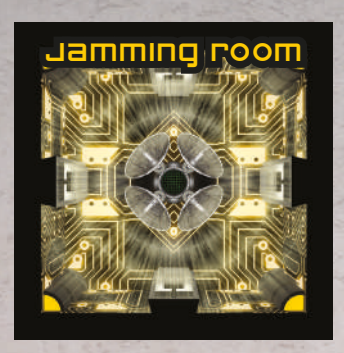
"Connection problem - please wait here while we reconnect."

As long as a character is in this room, no information can be exchanged between players, including discussion of programming or of the danger level of rooms.