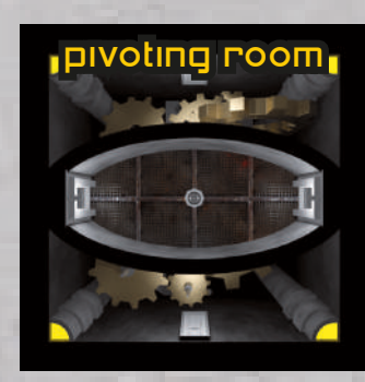
"Only two exits. It looks like an easy decision to me!"

While you're in this room, you can't use the Look action.