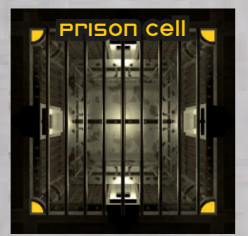
"A cell locked from the outside... I hope you have friends around!"

Take your character figurine and place it on the Central room.