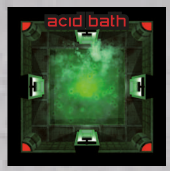
"An acid bath! Alone it's awesome, but it's even better to share it!"

As soon as two characters are in this room, the one who entered earlier is eliminated by the arrival of the second one.