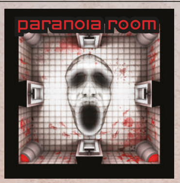
"You poor fools. You thought this was just a game?"

As long as a character is in this room, no information can be exchanged between players, including discussion of programming or of the danger level of rooms.