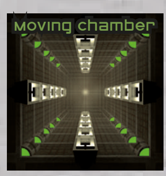
"Watch out it's shaking! And it's going to move!"

When entering, take this room and exchange it (and your figurine) with any hidden room on the board. The hidden room stays hidden. If all the rooms are already revealed, this room has no effect.