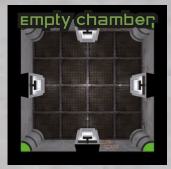
"Awesome, an empty room! Enjoy the break!"