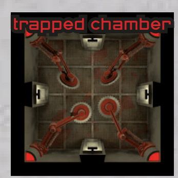
"I love your style! You just activated a deadly trap! 5, 4, 3..."

As soon as two characters are in this room, the one who entered earlier is eliminated by the arrival of the second one.