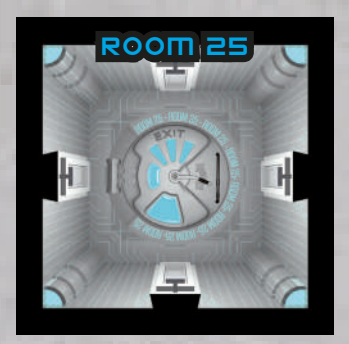
"If you're not alone, you're close to victory! Dive into the light and join me on stage, you're famous!"

This room cannot be moved in any way and will stay at the center for the entire game.