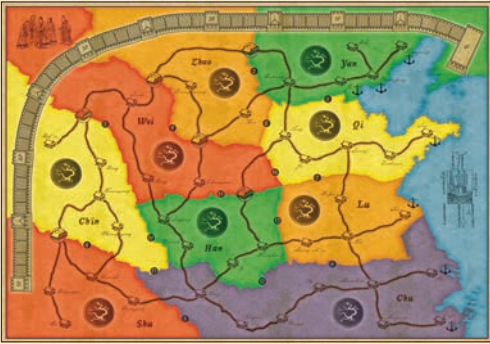
Border Disputes playing map, for 3-5 players