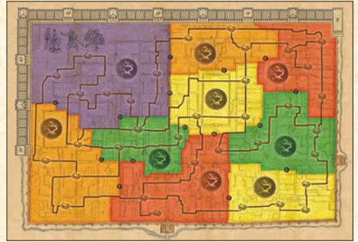
Ways of Diplomacy playing map, for 2-4 players