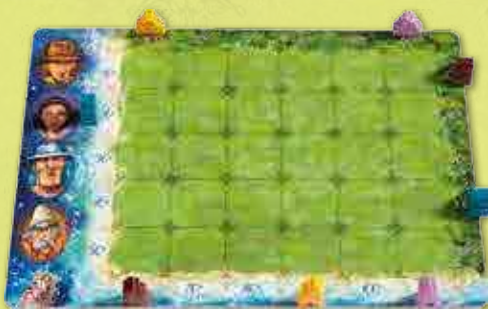
Here is what the islands could look like