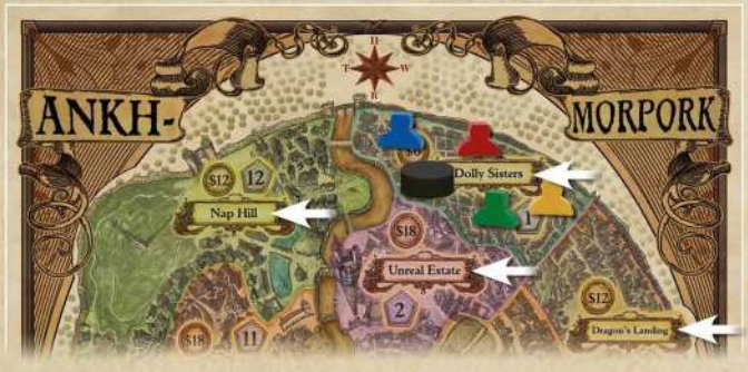
Example: Let's assume that you are the red player (for this and all other examples) and you have just played a card with the 'Place a minion' symbol on it. As you already have a minion

You take one of your minion pieces and you place it in an area on the board. You must place it in either an area that you already have a minion in or in an adjacent area. There is no limit on the number of minions that can be placed in an area. If you already have all of your minions on the board then you can remove one and then place it somewhere else (making sure you follow the other rules above). These rules apply whenever you have to place a minion, including due to the play of an interrupt card. If you do not have a minion on the board then you can place your minion in any area.