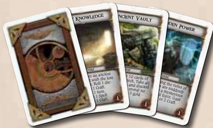
25 REMNANT CARDS