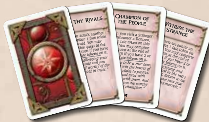
6 WARLOCK QUEST CARDS