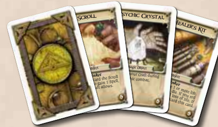
24 PURCHASE CARDS