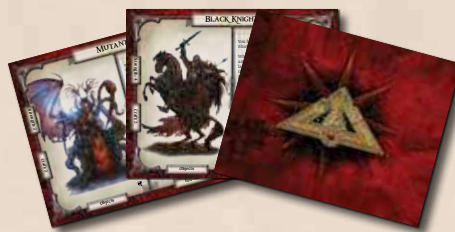
5 CHARACTER CARDS