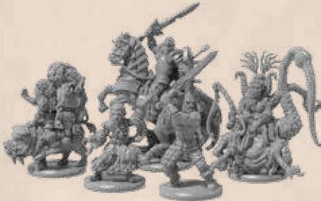
5 CHARACTER FIGURES