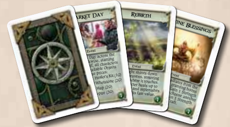
47 ADVENTURE CARDS