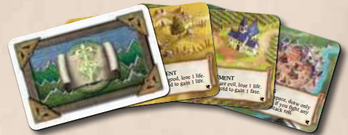
10 TERRAIN CARDS