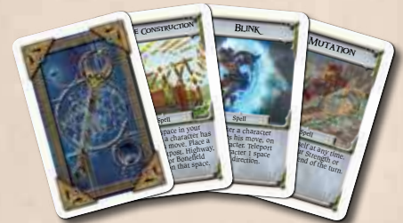
10 SPELL CARDS