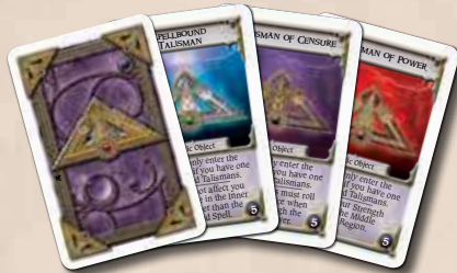
6 TALISMAN CARDS