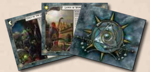
4 ALTERNATIVE ENDING CARDS