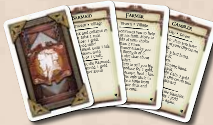
40 DENIZEN CARDS