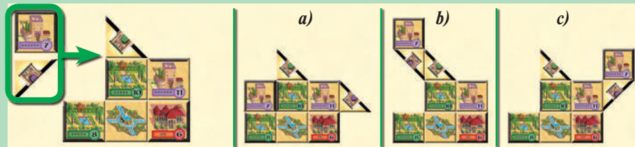
Examples of how to legally place a tower and portal.