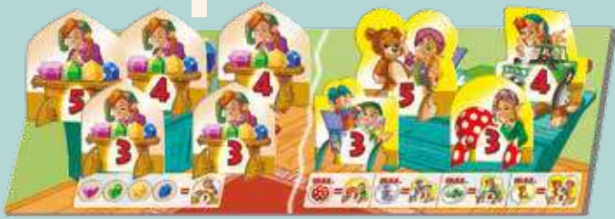
5 gem trophies & 4 toy trophies

Fix the trophies to their corresponding bases. Place the gem trophies on the left side of the trophy board, the toy trophies on the right side.