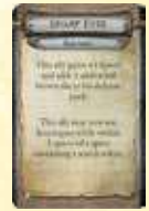
ALLY SKILL CARD

Throughout the course of a Labyrinth of Ruin campaign, heroes will have the chance to upgrade their allies through the use of ally skills. When the heroes receive an ally skill as a reward from a quest, the heroes take the listed Ally Skill card associated with their current ally. The Ally Skill card functions similarly to Class cards and lists special abilities and actions now available to the ally.