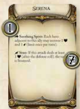
ALLY CARD BACK