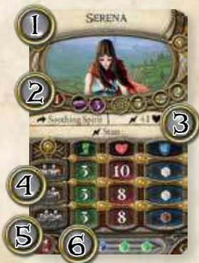
ALLY CARD FRONT