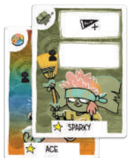
Example Setup for Two Players