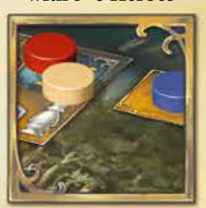
Page 8: Game Variants