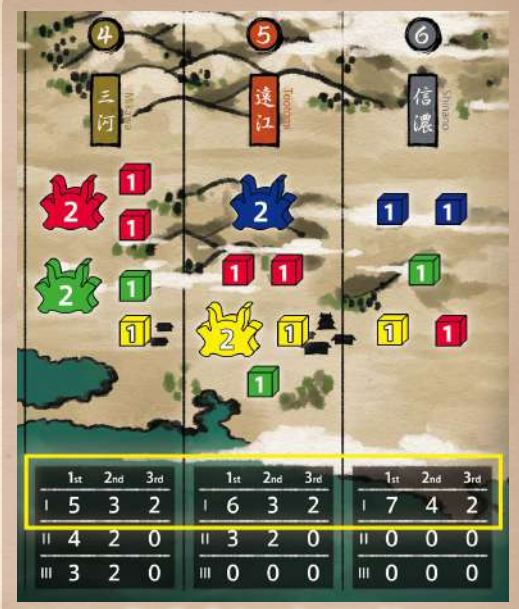
Use the first row for round 1