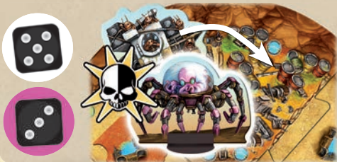
Example: Nina (pink) also lands on the stop sign with Amir (white). The ensuing fight is won by Amir who advances one space onto the scrap yard.

If 2 racers land on the Stop space a fight occurs as usual, and the winner advances by one space to the scrap yard, also as usual.