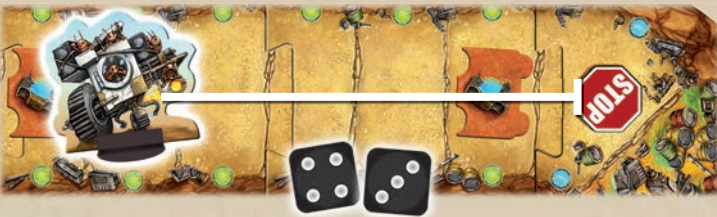
Example: Amir (white) has rolled a 7 but can only move 5 spaces until he hits the stop space.

A racer must stop on the Stop space and end its movement there; any surplus movement points are lost. Using an ability or a bonus card is no help – the racer must always stop on this space. Only on their next turn may the player move on from this space. The scrap yard space ( next to the Stop space ) is an ordinary space like others.