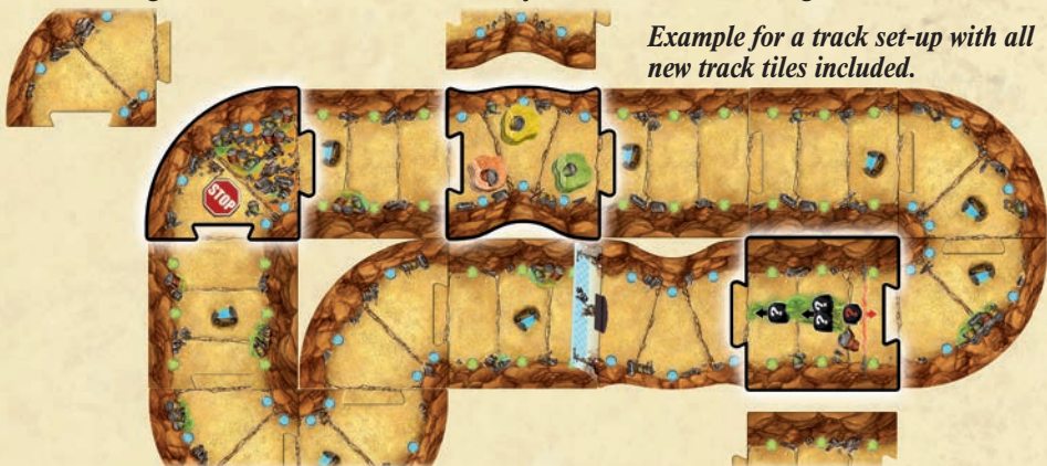
Example for a track set-up with all new track tiles included.

At the start of the game, the players decide if they want to include 1, 2, or all 3 of the new tracks. After assembling the complete race course, they randomly select matching tracks and exchange them for the new tracks they had selected for this game.