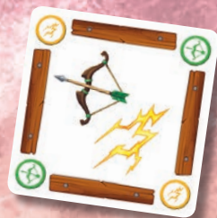
Combo card example

When you reveal a card with two Weapons or Spells on it, it counts as both of those symbols.