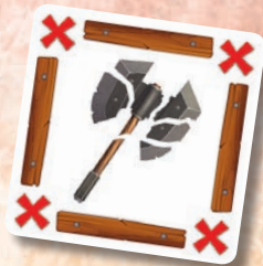
Failed Attack card example

Some of the Weapons & Spells cards have an X on each corner (instead of their normal symbol) and they are shown somehow broken. These cards do not count as the Weapon or Spell they show – they are there to confuse you.