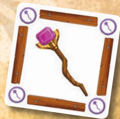
Wizard's Staff card example

The Staff is a wild symbol. It counts as any Weapon or Spell.