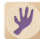
Arms and hands