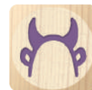
Horns and ears