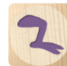
Legs and feet