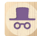
Hat and glasses