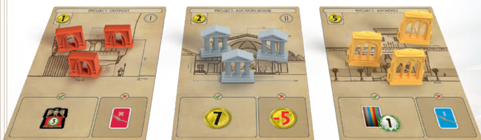
Setup example for a 5-player game