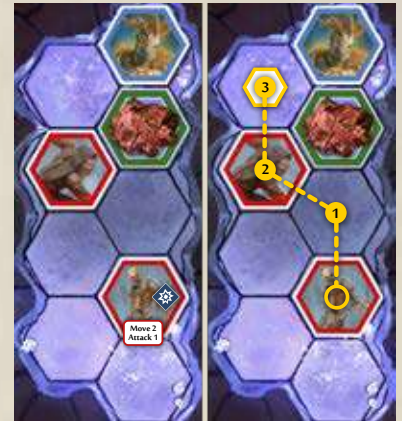
> Path to attack-hex?

If no such path exists, the monster cannot find focus and will not move or attack.