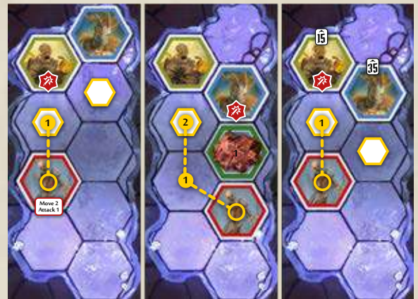
Path length > Proximity > Initiative order

Rules for initiative order for figures with identical initiative value: non-leading ability cards break ties, if still tied players decide; summons activate directly before their controller; characters performing a long rest activate last; characters activate before monsters