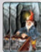
7 Gold Miners