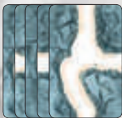
44 Path Cards