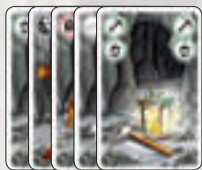
27 Action Cards