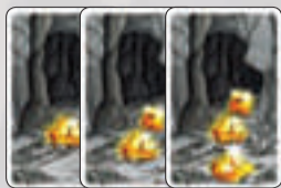
28 Gold Nugget Cards