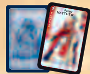
24 Suspect cards