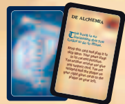
24 Scriptorium book cards