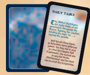
18 Event cards