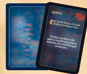
6 Crypt cards