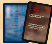
8 Library book cards