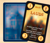
8 Mass cards