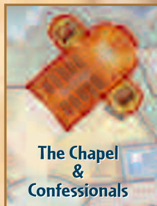
The Chapel & Confessionals

Beware: the owner of a cell may enter it even if there is already another pawn in it. In this