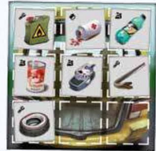
Cargo bay with different items (example for 4 players)