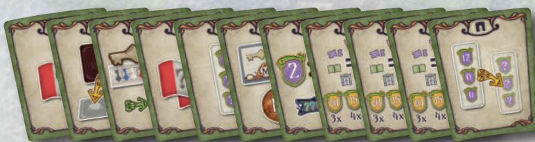
11 Bonus Tiles