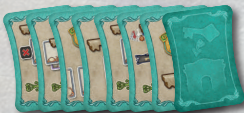
7 Strategy Tiles