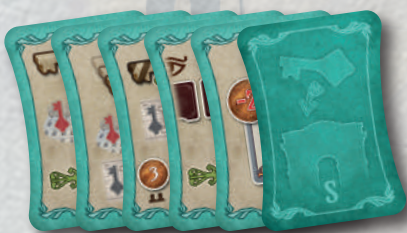
5 Starting Strategy Tiles