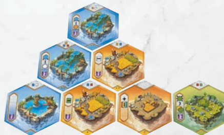
This universe is valid.

If players comply with these three rules, they can start the second and even the third row before they have completed their first row of 5 tiles.