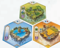
Invalid placement: one of the tiles of the previous row must be of the same color than the newly placed tile.

➤ At least one of those two tiles must be of the same color than the newly placed tile.