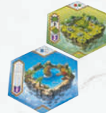
Invalid placement: a tile must be placed on two tiles of the previous row.

➤ At least one of those two tiles must be of the same color than the newly placed tile.