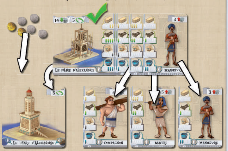
The player gains 14 Sesterces as indicated on the card, then flips it over to score 5 victory points.

By sending this "laborer" Worker for 3 Sesterces to the "Alexandria Lighthouse" building, the player completes the requirements of the Building. The Alexandria lighthouse requires 2 stones, 4 wood, 1 architecture, and 3 decorations. The last Worker added brings 1 wood and 2 decorations which were missing. The Alexandria lighthouse is therefore finished.