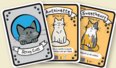
Stray Cat Cards