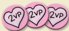
Victory Point Tokens (VP)