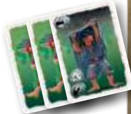
2 Trolls and 1 Storm Troll