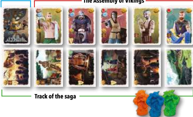
Track of the saga