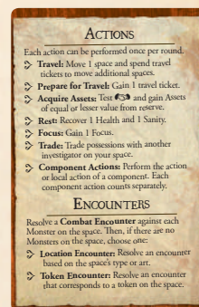
Round Overview Card