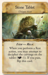
Unique Asset Card

Some encounters in this expansion reward investigators with various Unique Assets. Like Spells or Conditions, Unique Assets are double-sided cards. An investigator cannot look at the back of a Unique Asset unless an effect allows him to.