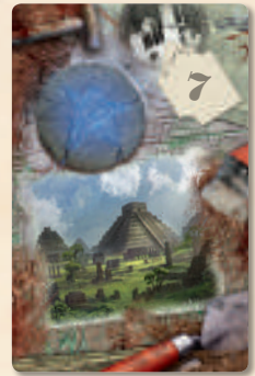
Mystic Ruins Encounter Card

To setup the Mystic Ruins Encounter deck, shuffle all Mystic Ruins Encounter cards into a single deck. Then another player cuts the deck.