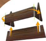
Assembly of the display