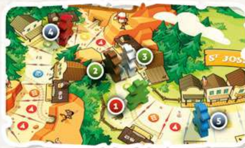
Ted (brown) and Bill (white) can call Harry's (green) bluff.

Players in prison can never call a bluff, and their riders are ignored when determining who can call a bluff. If all other players are in prison, the active player can claim any hand since no one can call the bluff.