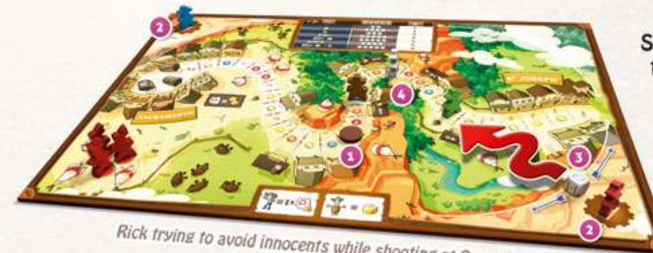
Rick trying to avoid innocents while shooting at Sammy.

Place the gunfight marker on the space where the two riders stand. 1 Each player then takes his rider and places it on one of the "duel" spaces in the opposite corners of the board, 2 with the player who just moved to the space deciding where each rider will stand. Each duelist takes one die in hand.