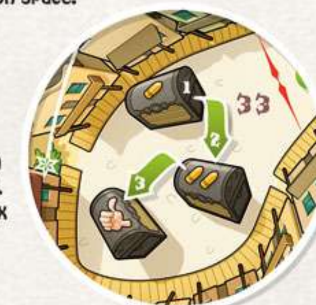
Delivering mail in Sacramento

As soon as the first player reaches Sacramento, he places his rider on the first mailbox. On his next turn, if no other player has reached Sacramento, he moves to the second mailbox. On his following turn, if no player has reached Sacramento, he moves to the third mailbox and immediately wins the game (see "Victory: two ways to win").