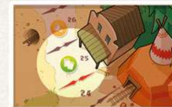
The desert starts in space 25

Exception #2: Once a player enters the desert, which starts on space #25, the price for rerolling dice is 2 gold instead of 1.