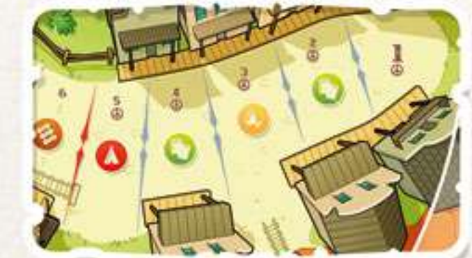
St. Joseph is a peaceful town

Exception: The first five spaces on the track are in St. Joseph, the Pony Express HQ. Two or more riders can stand on these spaces peacefully (☺) with no gunfight or poker game taking place.