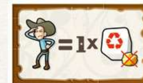
Last player gets a free reroll

Exception #1: If the active player is alone in last place, he can reroll once for free, but must pay normally for any further rerolls.