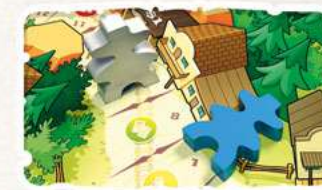
Sammy (blue) is in prison

If he doesn't pay, he rolls the dice only once . If he rolls two pairs or better, the following effect applies. (If he rolls less than two pairs, nothing happens).