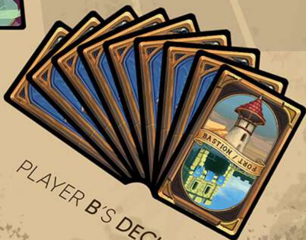
PLAYER B'S DECK