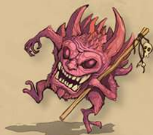
PLAYER A'S KINGDOM