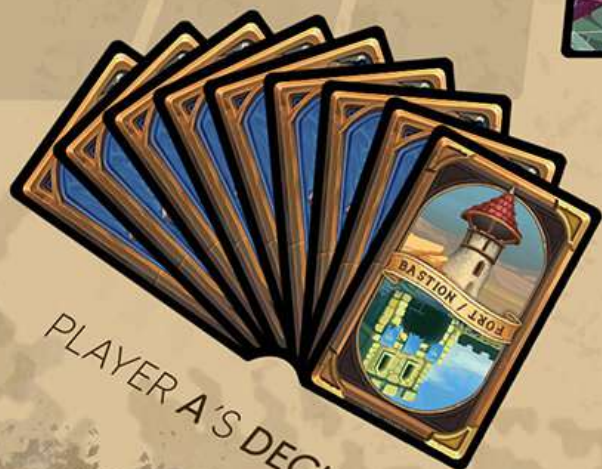
PLAYER A'S DECK