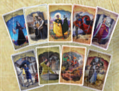
9 Character Cards