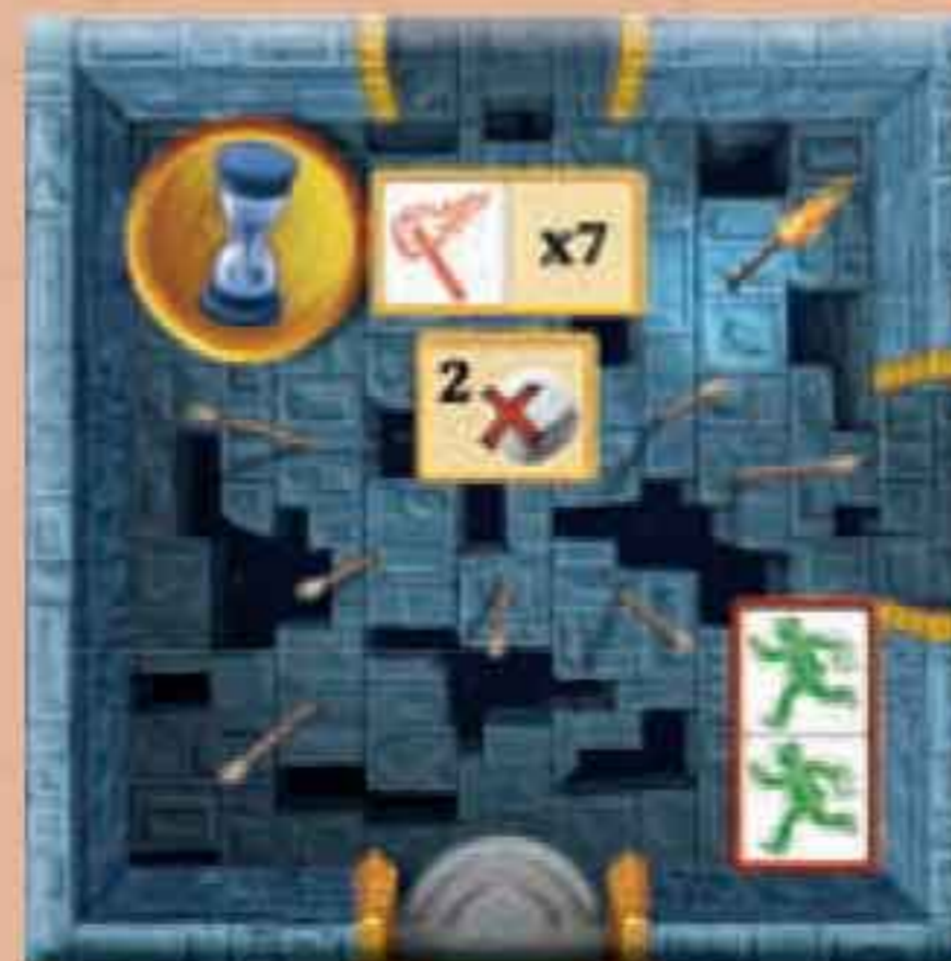
1x Torch chamber