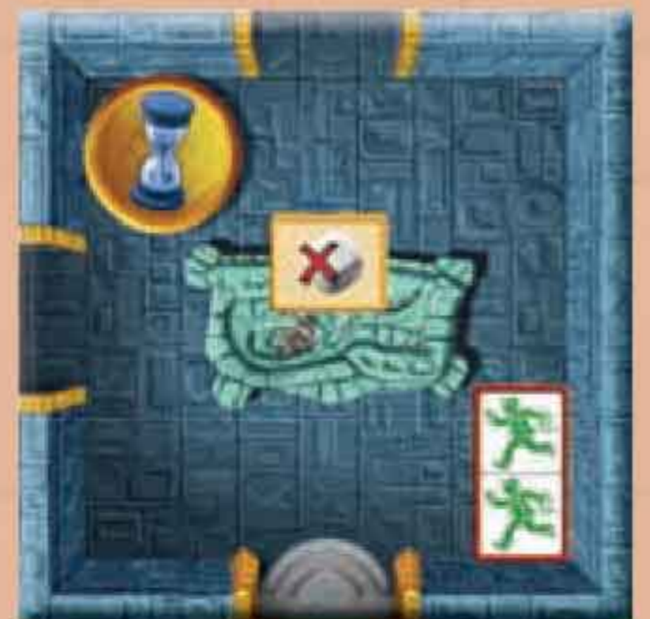
1x Sacrifice chamber