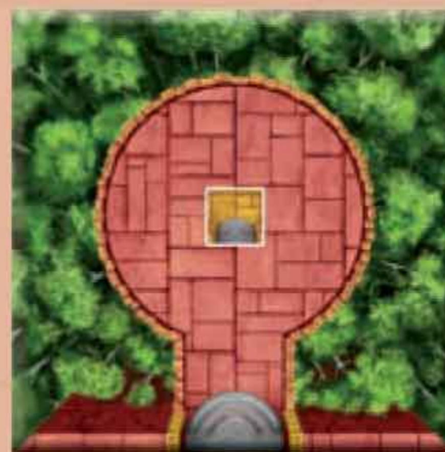
1x Moving platform