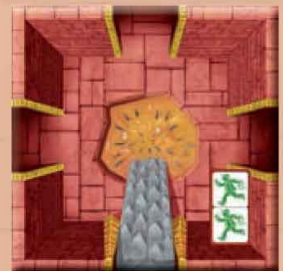
1x Slide trap