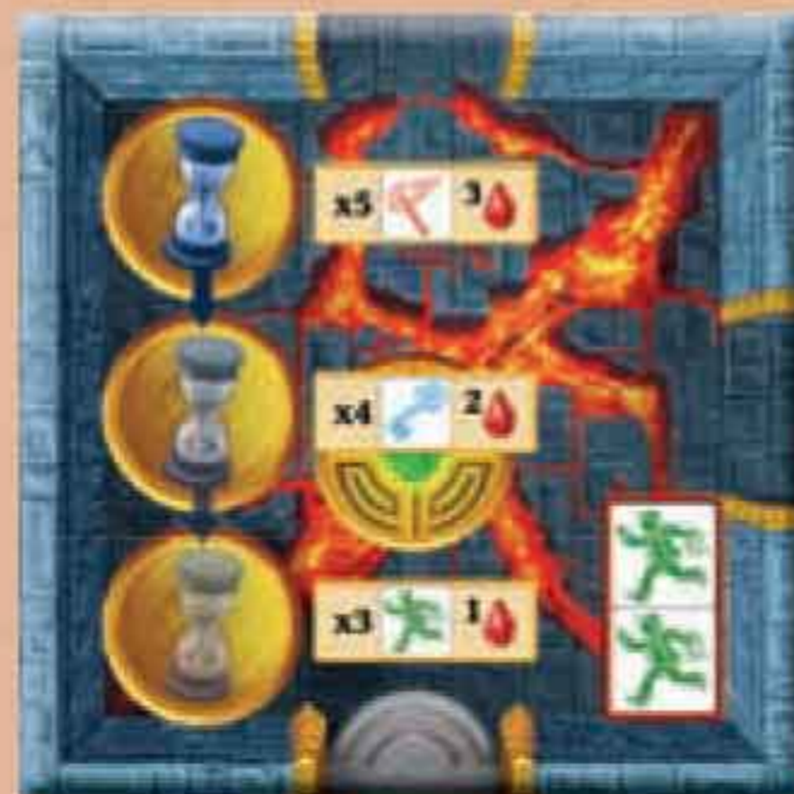
2x Lava chamber