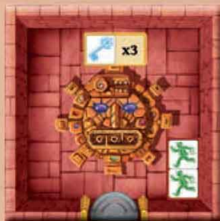
1x Invocation chamber