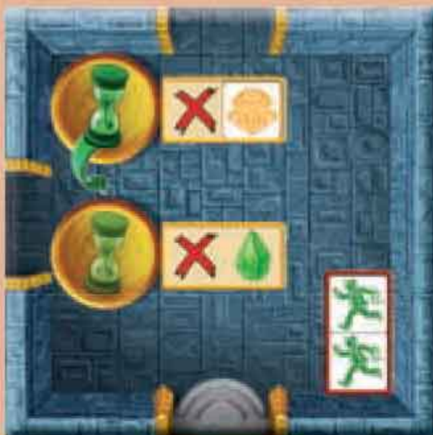
4x Prohibition chamber