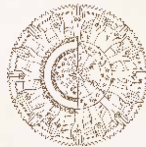
"The Friends of Oberon" Club

Whispers say that Buckingham Palace has asked for his help more than once to discover and neutralize other shape-changers that might try to infiltrate the queen's household. His prestige has allowed him to meet and flatter the most powerful and wealthy citizens of London. He founded "The Friends of Oberon" club with their assistance, a group dedicated to promoting cooperation between the British Empire and Oberon's kingdom. Fox often regales members and guests with nostalgic memories of his homeland.