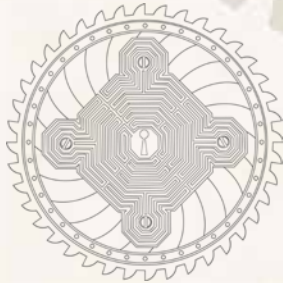
"The Maze" Club

Uncanny entities and events abound in London—some stranger than others—and the effects of their passing show like scars on the city. Few give much thought to the damaged and abandoned buildings, even the post office of Saint Pancras. Fewer still suspect that this ruin plays host each week the meetings of the “Maze”, a club restricted to people who can speak to ghosts. With great discretion, its members share what they have learned from the dead. They seek a truth that most mortals cannot grasp, but most are mediums of mediocre skill. None of them, or anyone else, knows that among their number walks Sir Daniel Home, the greatest medium alive.