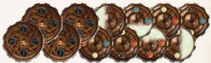
12 LOCATION TILES