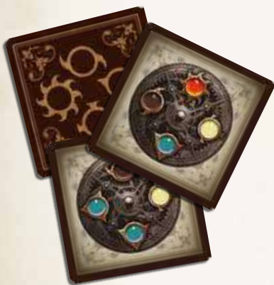
8 SECRET GATE CARDS