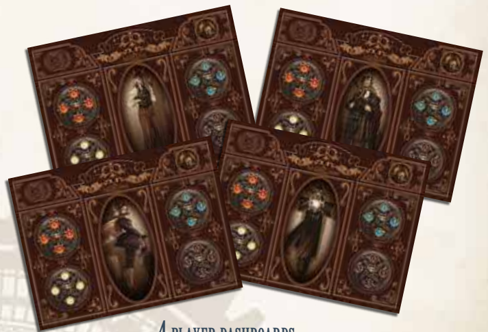
4 PLAYER DASHBOARDS