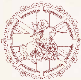
“Knights of Saint-George” Club

The “Knights of Saint-George”, said to be to oldest club in London, is composed exclusively of retired soldiers who share a belief in traditional definitions of valor and an extreme loyalty to the crown.