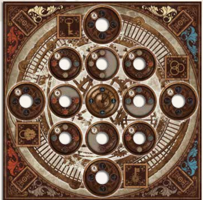
1 GAME BOARD