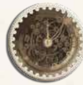
1 FIRST PLAYER/ SHADOW MASTER TOKEN