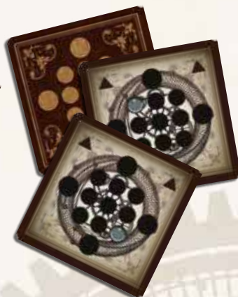
13 SECRET COMBINATION CARDS