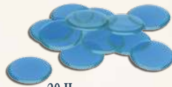
30 HOURGLASS TOKENS