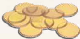
16 ETHER COUNTERS