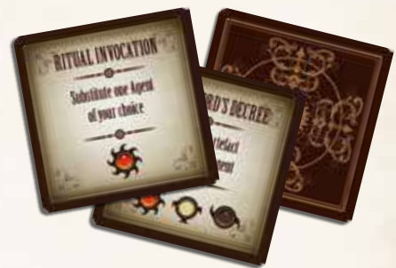
24 SPECIAL ACTION CARDS