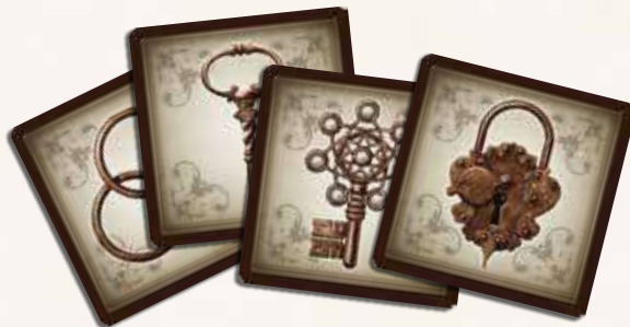
16 ARTEFACT CARDS (4 OF EACH TYPE)