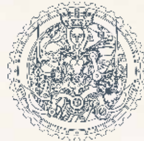
“The Mechanical Siren” Club

On their return to London, Babbage entrusted Parvin to the only female member of the Brotherhood: the Countess Ada Lovelace. A brilliant mechanic, Lady Lovelace was also the president of “The Mechanical Siren” club. In sad truth, despite the matriarchal presence of Queen Victoria, most gentlemen could more easily accept the appearance of fighting spirits, living dead, and other chimeras on London's streets than they could the idea of women doing anything more than keeping a tidy home. The Sirens keep track of, and attempt to recruit, scholars and freethinkers interested in changing this state of affairs.