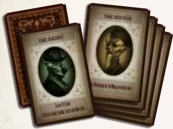
6 AGENT CARDS