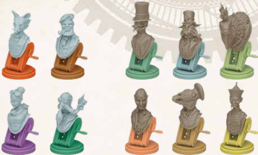
4 GENTLEMAN FIGURES