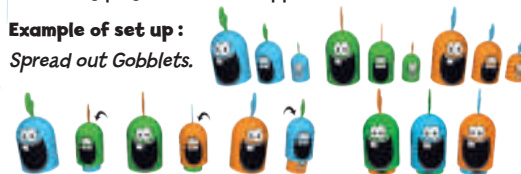
Piled up Gobblers.