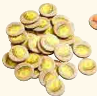
35x legal gold nuggets