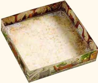
1 gold mine (box base with insert for explosion effect)