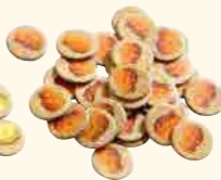
35x illegal gold nuggets