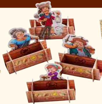
4 characters with gold chests,