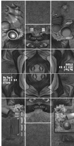
The Big Top