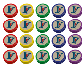
20 Influence Tokens