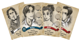
17 Character Cards