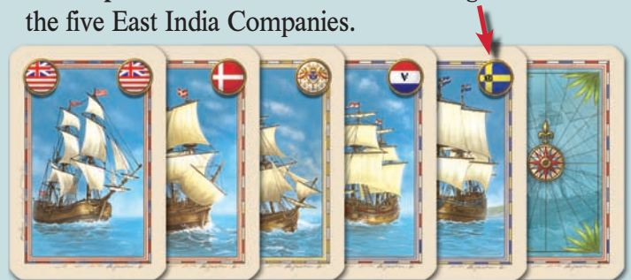
The companies come from the nations (left to right): Britain, Denmark, France, Netherlands, Sweden