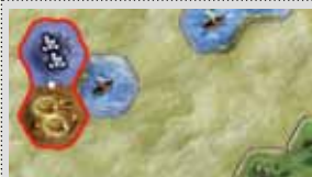
Mountains + Hills side

You can connect to this later in the game, just as you can connect to the terrain spaces printed on the board. No tile can be placed adjacent to this tile at the beginning of the game!