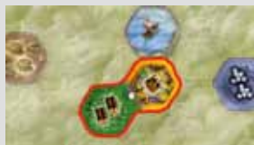
Forest + City side

Before mixing in the new double tiles, first remove a certain number of the original tiles from the game without looking at them: with 4 players, remove 16 tiles (instead of 4), with 3 players, remove 20 tiles (instead of 8) and with 2 players, remove 24 tiles (instead of 12). Only then do you mix the new double tiles with the remaining double tiles to form the face-down draw piles.