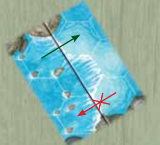
Only in this direction!