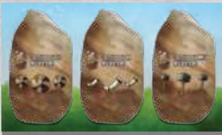
1st Runestone Board with 3 Inscription Runestones