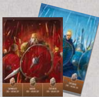
4 x Clan Boards (in 4 player colours)