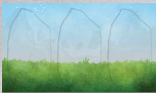
2 x Double-sided Runestone Boards