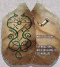
6 x Raiders Runestones (Green back)