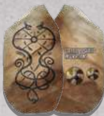
3 x Inscription Runestones (Black back)