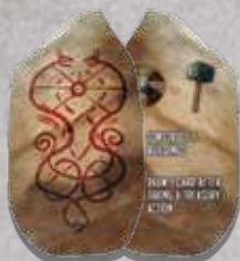
6 x Shipwrights Runestones (Red back)