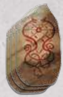
3 Facedown Runestones from the current chapter