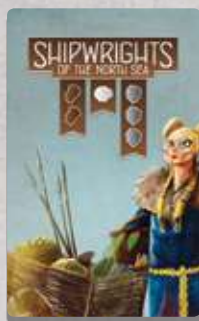
16 x Shipwrights Cards (For adding to the base game)