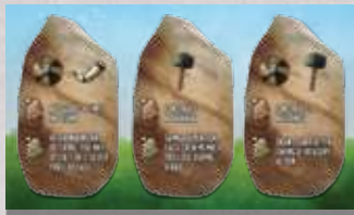
2nd Runestone Board with 3 Runestones from the current chapter