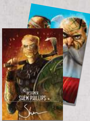
2 x Signed Collector Prints and 3 Box Art Prints