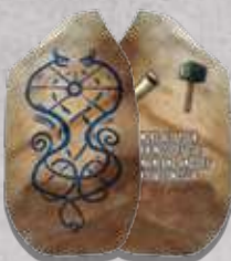
6 x Explorers Runestones (Blue back)