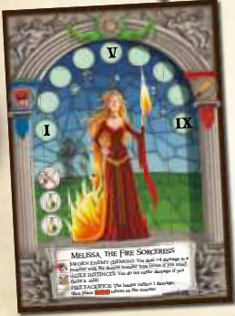
1 Hero Sheet